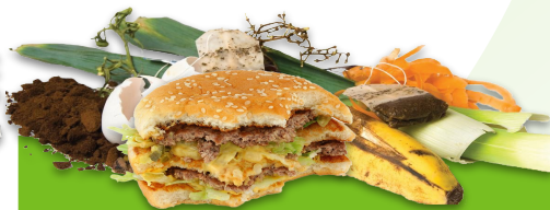
Food Waste Collection (if food waste is produced) > Caddies available for small producers (no minimum)