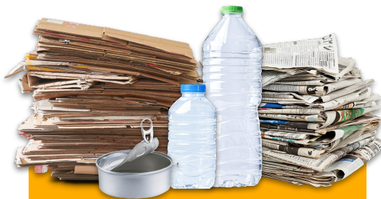
Dry Mixed Recyclables Collection (with items in scope) Cardboard collections (where appropriate)