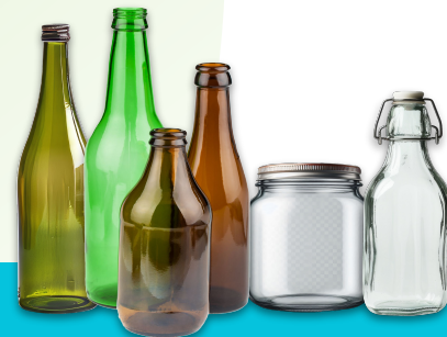
Glass Collection (if glass is produced)